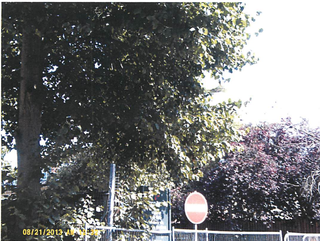
VIEW FROM BIT FURTHER ON , ALONG THE SAME FOOTPATH, RIGHT NEXT TO THOMAS DEACON ACADEMY ENTRANCE GATES, WHICH IS ADJACENT TO OUR BUILDING