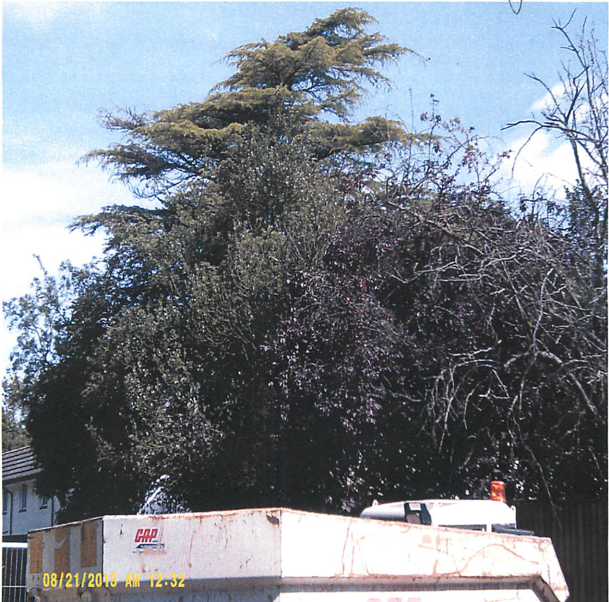
VIEW FROM ACROSS THE ROAD( FROM THE LEFT) ONLY SHOWS THE TOP PART OF THE TREE, AS REST OF THE VIEW IS BLOCKED BY OTHER TREES