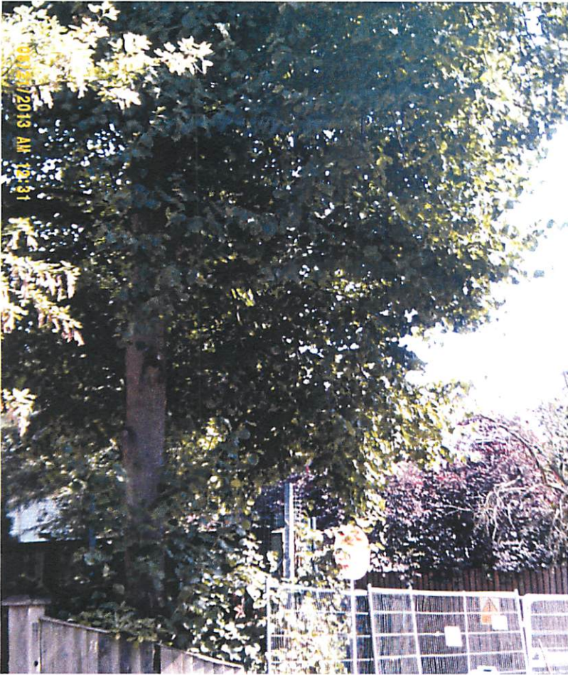
VIEW – LOOKING TOWARDS THE BUILDING, WALKING FROM LEFT ON THE FOOTPATH