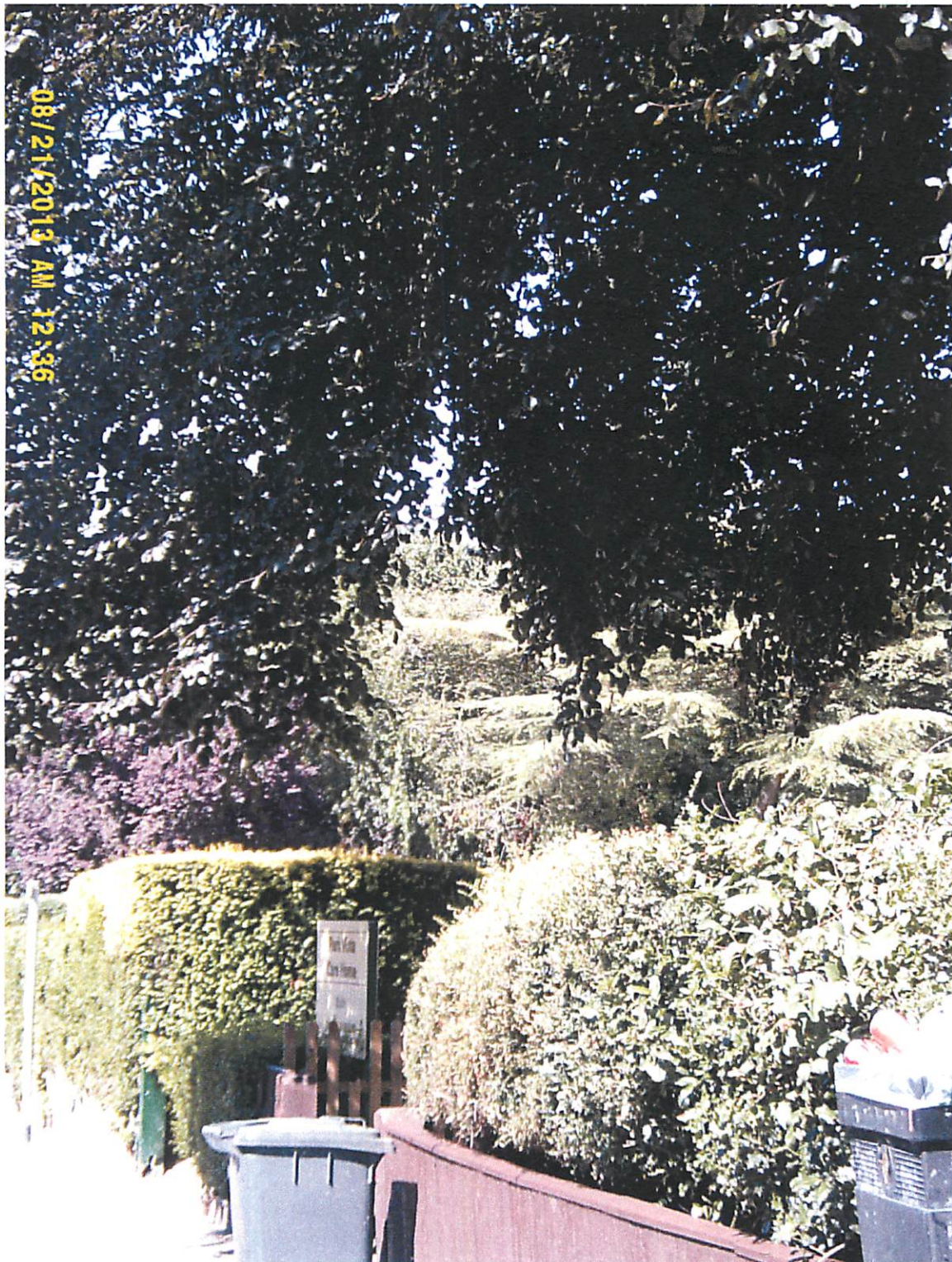
VIEW FROM THE RIGHT, WALKING ALONG THE ADJACENT FOOTPATH, CLEARLY SHOWS THAT THE VIEW OF THIS TREE IS CONCEALED BY OTHER TREE.