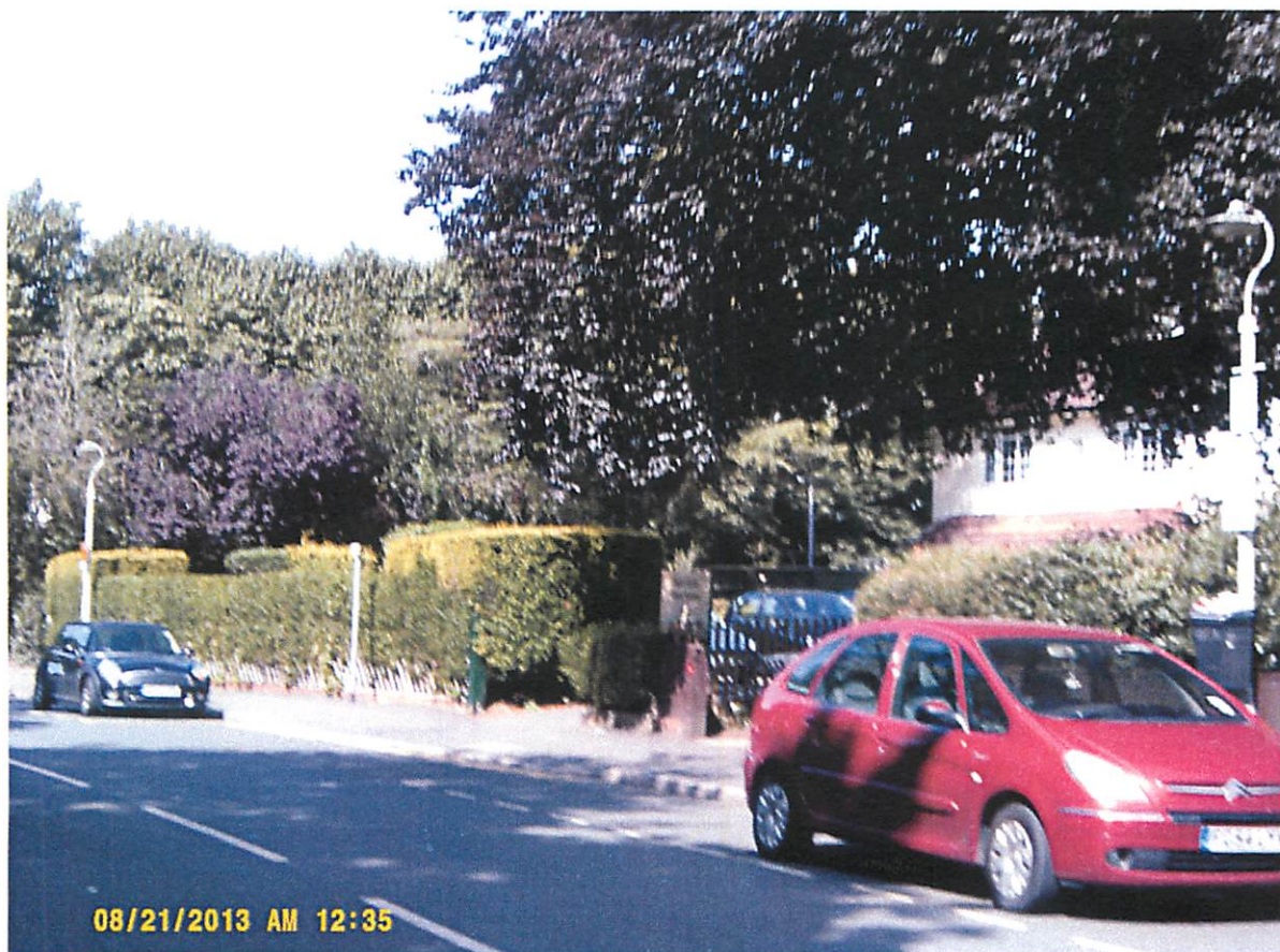
VIEWS FROM ACROSS THE STREET, COMING FROM THE RIGHT CLEARLY SHOWS THAT THE VIEW IS NOT SIGNIFICANT DUE TO PRESENCE OF A MUCH LARGER TREE IN FRONT, ON THE STREET.