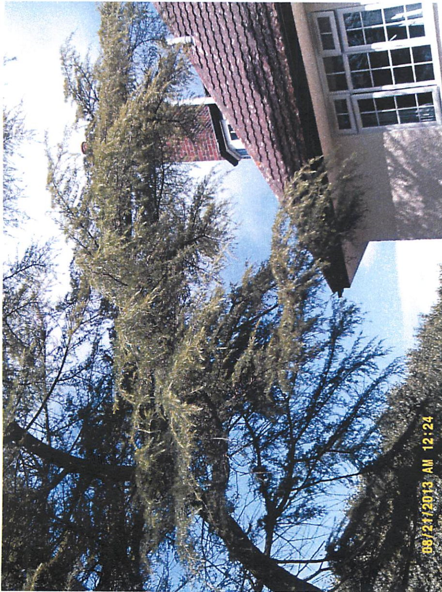
THIS LARGE BRANCH OF THE TREE IS IN CLOSE PROXIMITY TO THE BUILDING