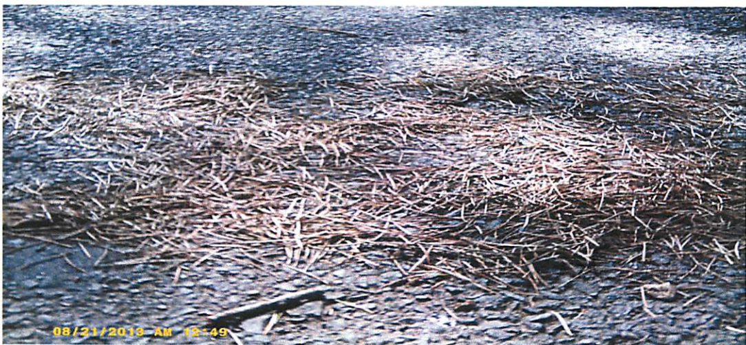
MORE PICTURES OF NEEDLES DROPPING AND OTHER SHEDDING FROM THE CEDAR TREE, CAUSING SLIPPERY CONDITIONS BELOW ON TARMAC